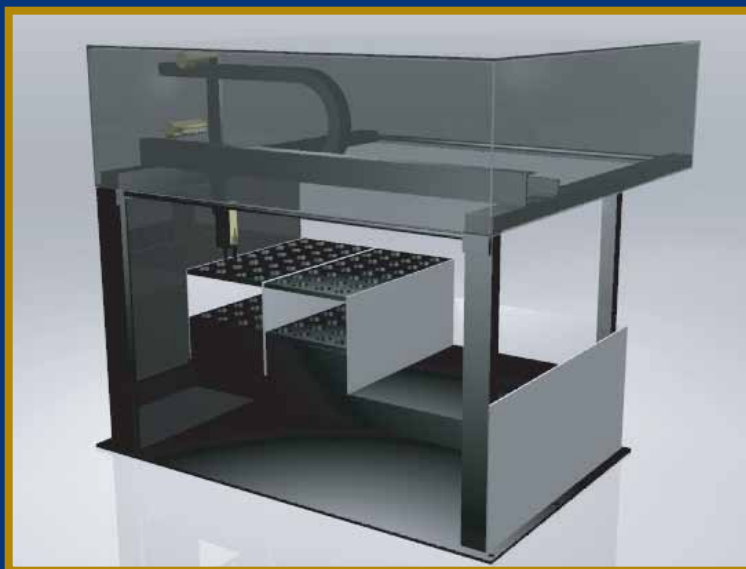
ASP 960 AutoSampler